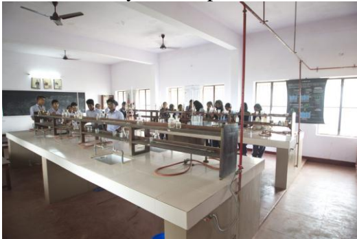
Physics lab photo