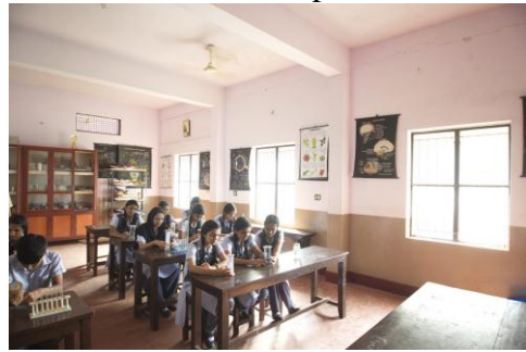
Science lab photo