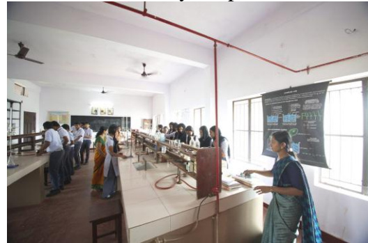
Chemistry lab photo